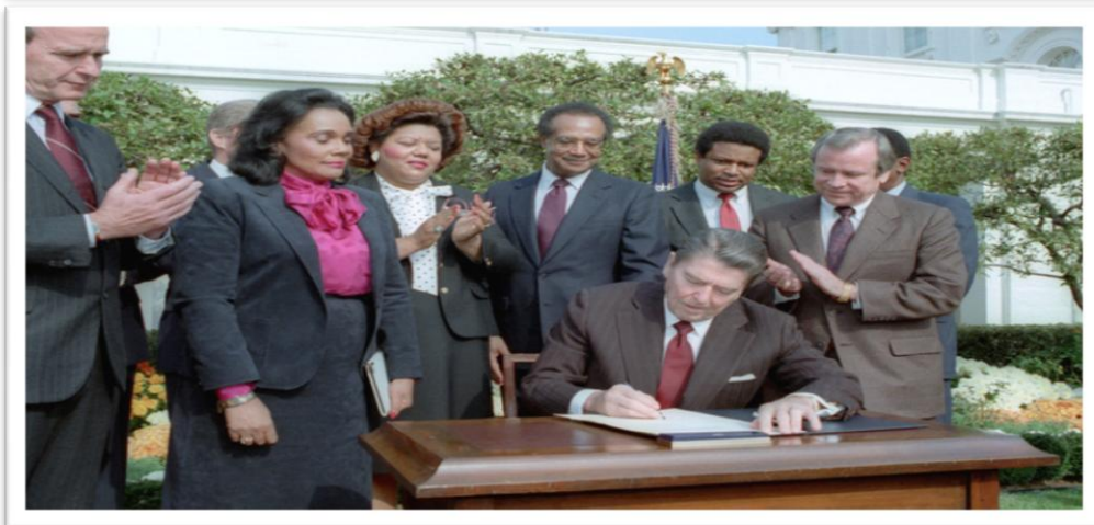
On November 3, 1983, President Reagan signed a bill decreeing the third Monday of every January Martin Luther King Jr. Day. Mrs. Coretta Scott King looks on.